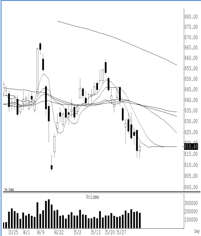
S50M24 (Close 818.40 Chg 1.90)